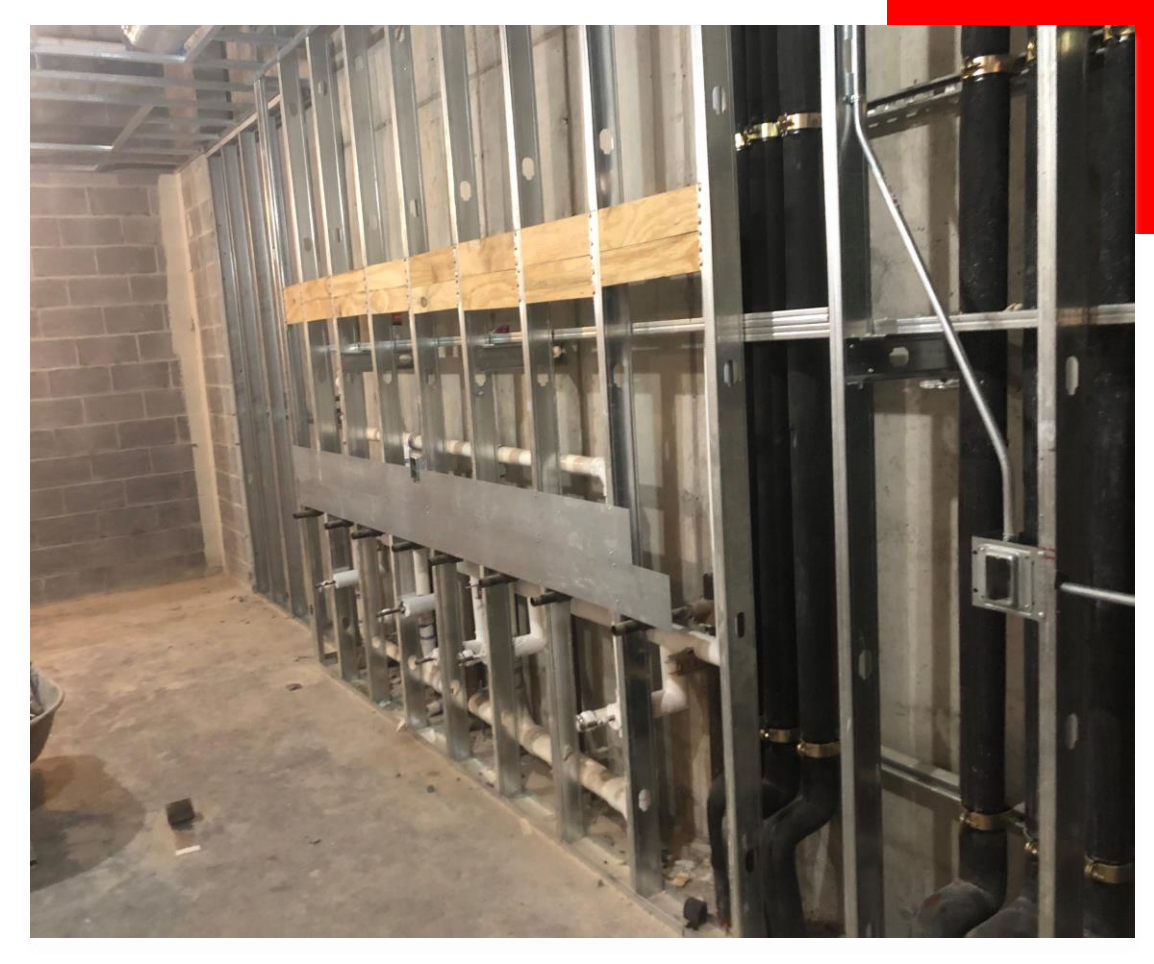
4<sup>th</sup> Floor Group Restroom Progress