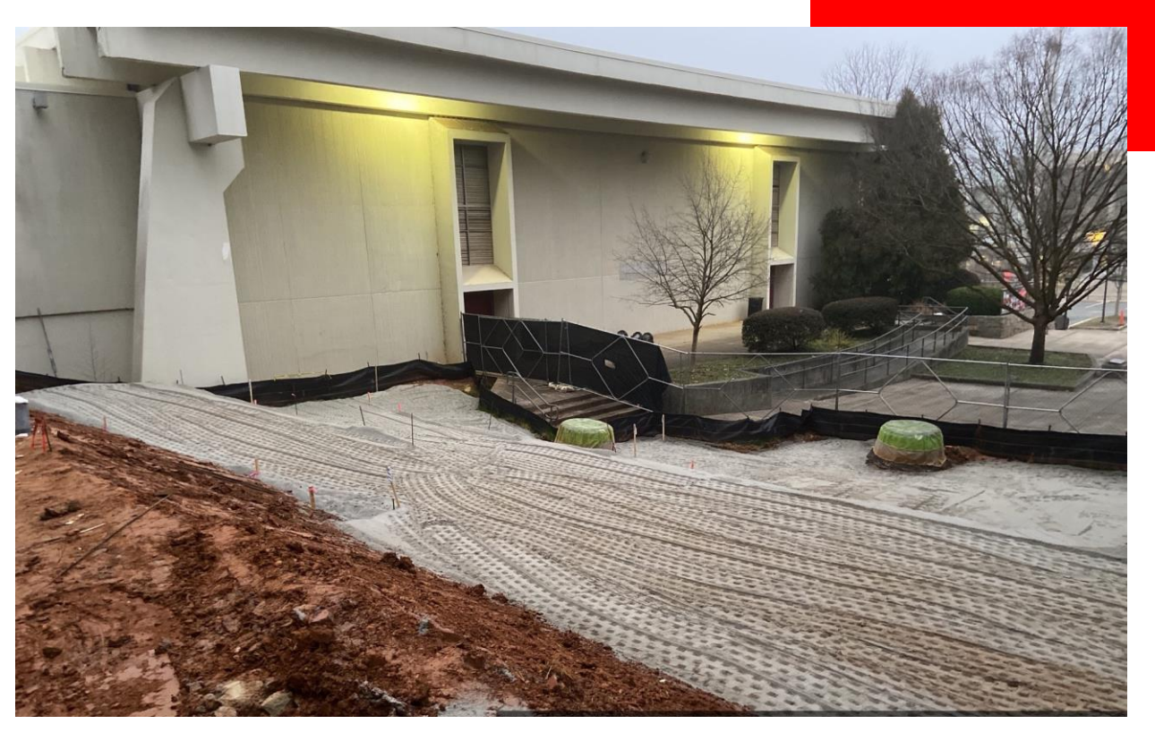
East Elevation of New Addition Being Prepared for Hardscapes