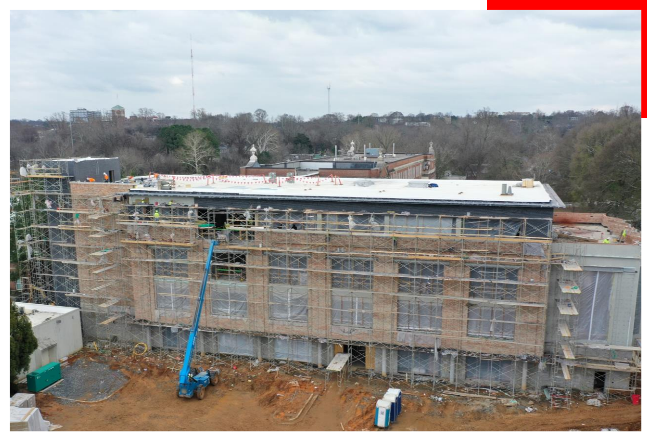
New Addition Progress – North Elevation